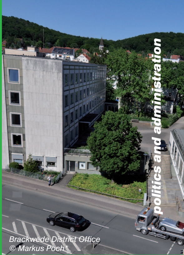
Brackwede District Office

The political structure in the borough is based on the decisions made at city level and incorporates these into the local level. Brackwede district council has an advisory function