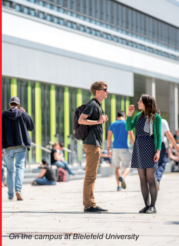
On the campus at Bielefeld University

There is not just one grammar school in the Brackwede district; Brackwede is home to all types of school, be it primary, secondary, grammar or