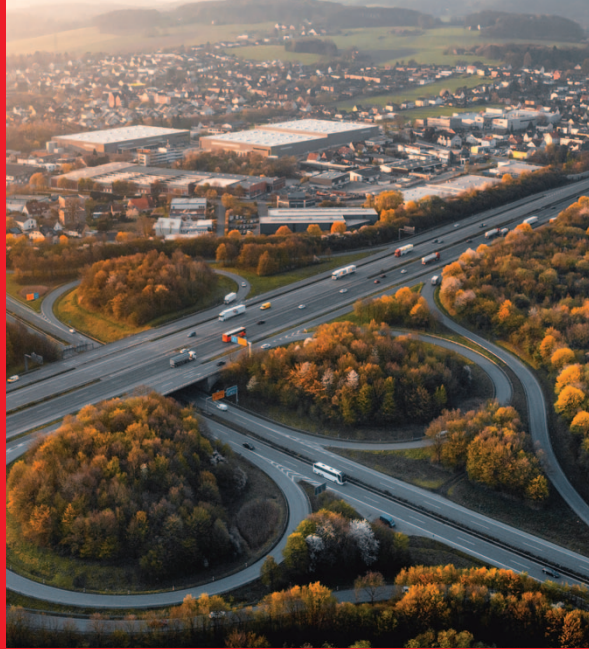
Industry and commerce along the motorway