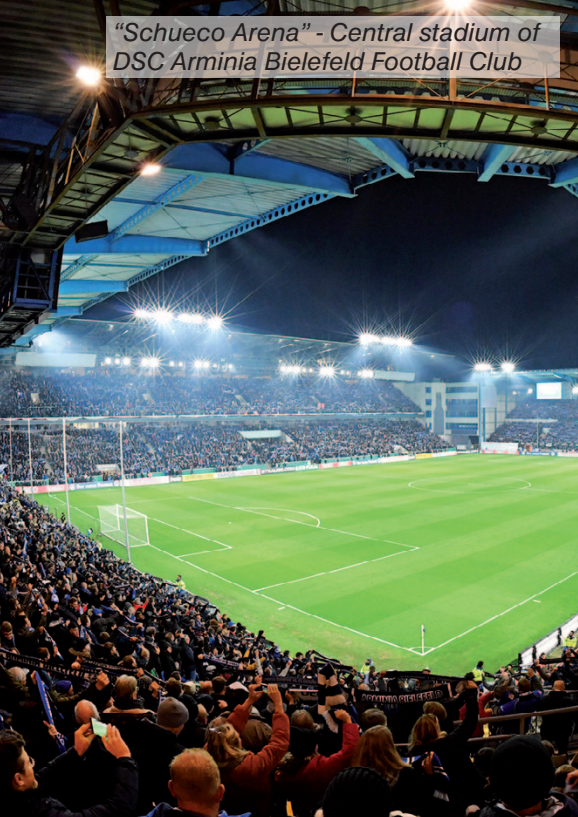
"Schueco Arena" - Central stadium of DSC Arminia Bielefeld Football Club

Several friendly matches and cultural exchange programmes have already taken place as part of this partnership. This partnership not only promotes sporting exchanges, but also the mutual familiarisation of the two cultures. The joint activities have strengthened the friendship and team spirit and offer both the players and everyone else unforgettable experiences. VFL Ummeln is committed to further expanding the international exchange and thus promoting sporting and interpersonal interaction. Other sporting activities are offered locally by the SV Brackwede and TuS Quelle for example. In Bielefeld the DSC Arminia is a traditional football club which currently plays in the Third League.