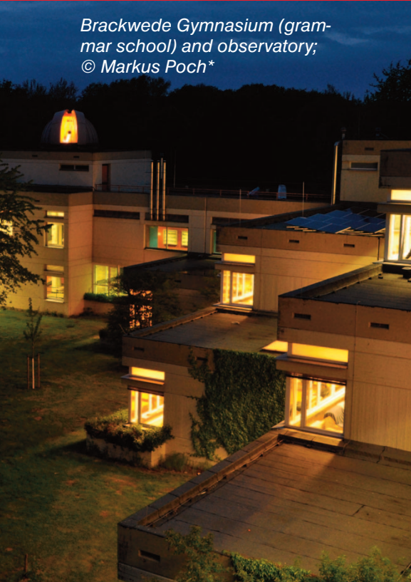
Brackwede Gymnasium (grammar school) and observatory; © Markus Poch*

comprehensive. There are also two vocational colleges in Brackwede, where students from all over the East Westphalian-Lippe region come to complete the theoretical part of their vocational training.