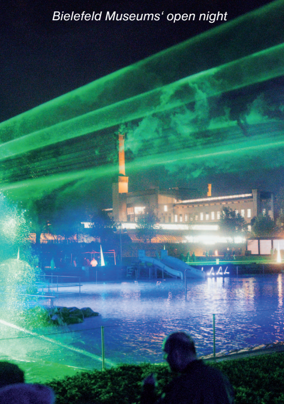
Bielefeld Museums' open night

the churches in Brackwede, Ummeln and Quelle. Choirs and club musicians perform, home-made goods and Christmas decorations are sold.