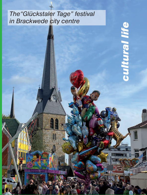
The "Glückstaler Tage" festival in Brackwede city centre

Three Christmas markets on two Advent weekends are organised around