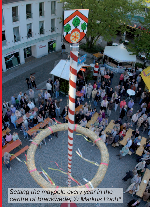
Setting the maypole every year in the centre of Brackwede

The district also has a strong tradition of civic engagement. Associations like the Queller community, the Naturrefreunds, or Pro Brackwede work to enhance urban development, environmental protection, and community well-being. They organize events that shape social life.