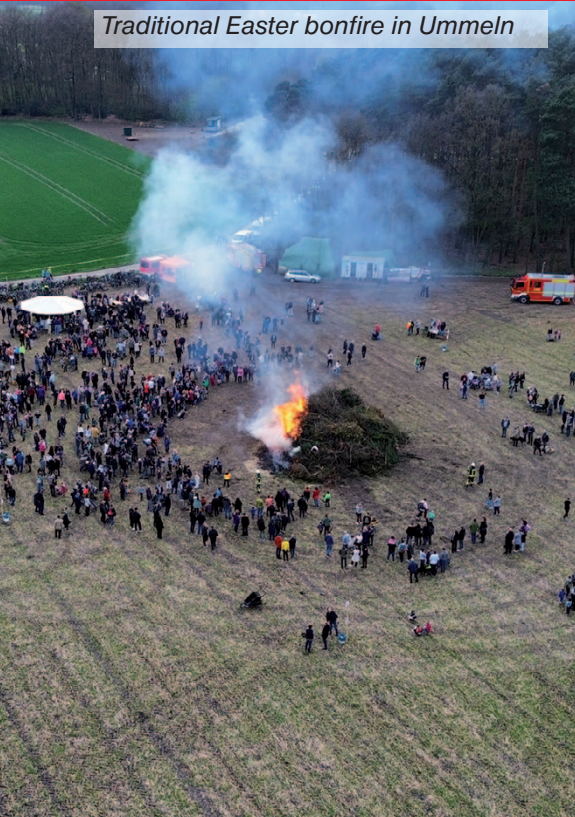
Traditional Easter bonfire in Ummeln

History enthusiasts find a home at the Brackwede History Society which preserves local documents and exhibits. Music lovers can join different clubs, like the Brackwede Choir or Orchestra, the Trombone Choir Ummeln, or the male choral society (“Harmonie”), which all perform in the region. There are also clubs catering to special interests, such as shooting or chess.